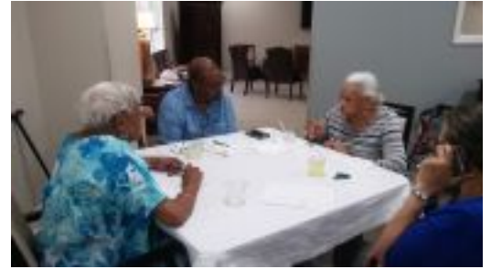
Word Games and S'mores!!!