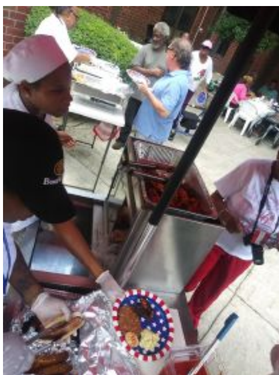
Fourth of July Cookout!!!