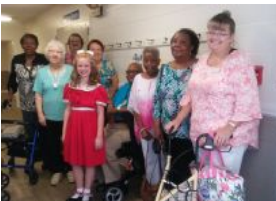
Residents enjoyed the viewing of "ANNIE"!!!!!!