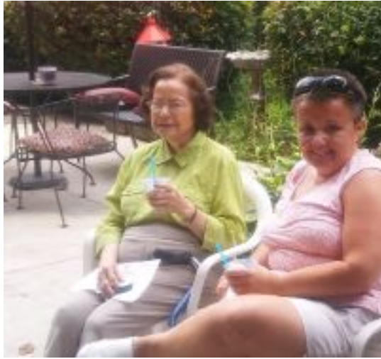
Lemonade in The Shade!!!!

Share your favorite memories of attending live concerts. Who performed, and where was the concert held?